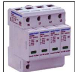
Surge Protection Devices